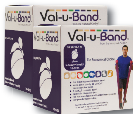
Twin-Pak® 2 50-yard boxes

Twin-Pak® offers 25% savings vs. 50-yard boxes