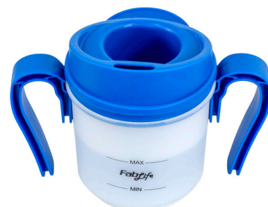
Use with two handles for extra stability