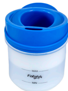
Use with no handles as a mug