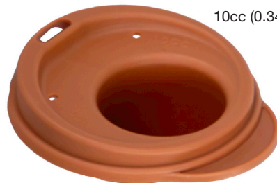
10cc (0.34 oz) lid