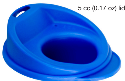
5 cc (0.17 oz) lid