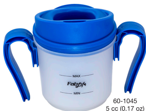
60-1045 5 cc (0.17 oz)