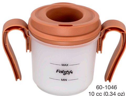
60-1046 10 cc (0.34 oz)