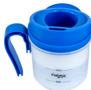
Use with one handle for a traditional grip