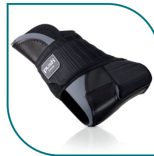
Push ortho Ankle Brace Aequi