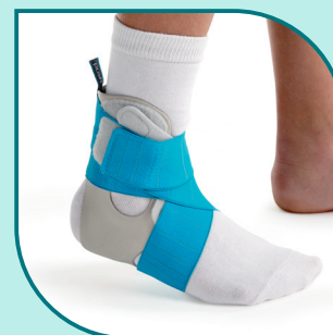
Push ortho Ankle Brace Aequi Jr.