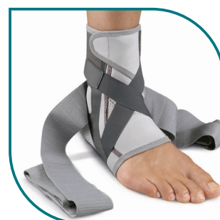
Assigned L-code L1902

"It [the Push med Ankle Brace] is wonderful, fit is very good, size recommendations per chart were accurate. Push products are very high quality. Been using them for 30 years!" — Lisa (therapist)