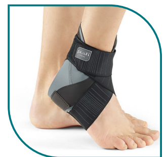
Assigned L-code L1902