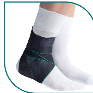
Push med Ankle Brace Aequi Flex