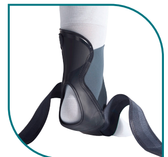
Assigned L-code L1902