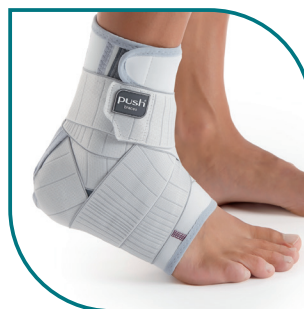
Push med Ankle Brace