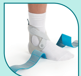
Assigned L-code L1902