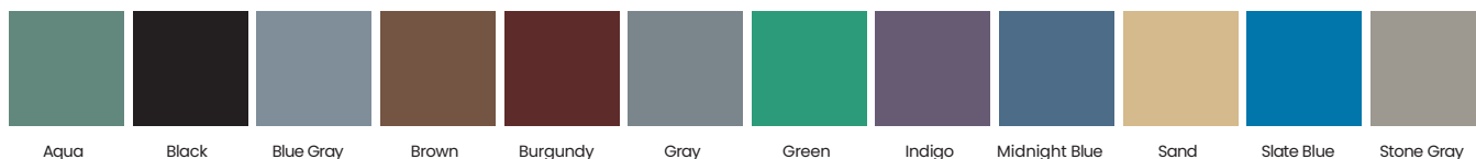
Aqua Black Blue Gray Brown Burgundy Gray Green Indigo Midnight Blue Sand Slate Blue Stone Gray

Our Intense Use Products Contribute to a Safe and Humane Environment.