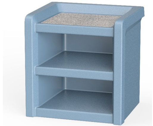
Optional smooth laminate top.