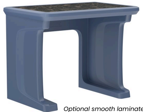
Optional smooth laminate top