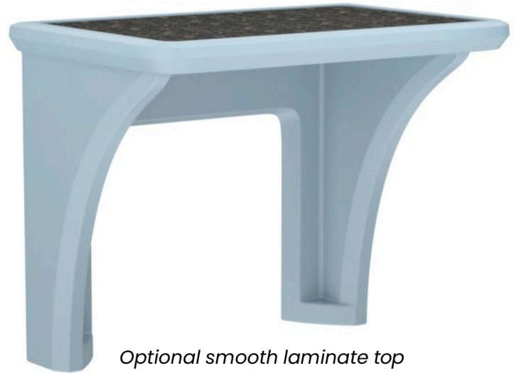
Optional smooth laminate top