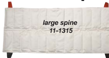
large spine 11-1315