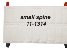
small spine 11-1314