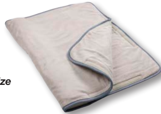
cold pack covers available for each size