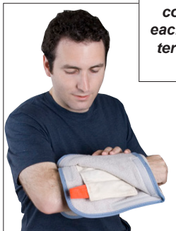
covers available for each size in foam filled terry cloth or all terry microfiber